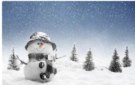
St Charles & St Thomas More Parish Hall 224 Aigburth Road L17 9PG

All are welcome, Messy Church is free to attend, though your donations are welcome.